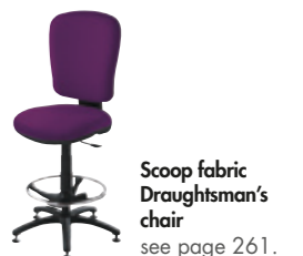
Scoop fabric Draughtsman's chair see page 261.